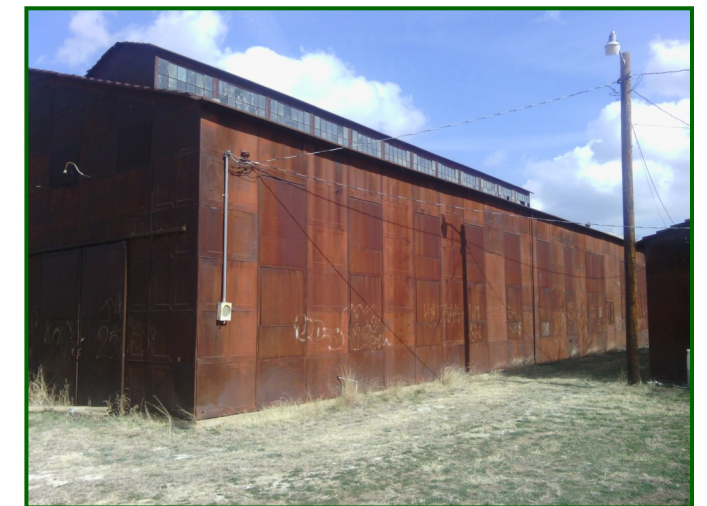
The old trolley barn of the “Abilene Traction Company”

The tracks have long-since been removed or paved over. The most visible reminder of Abilene's streetcars still remaining today is the big metal barn between North 10 th and North 11 th Streets, just west of Grape.