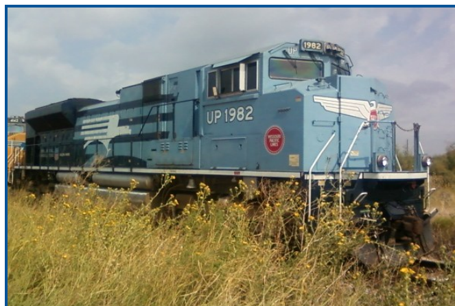
Here are two of UP's Heritage units which I photographed in Abilene – above is their tribute to the Missouri Pacific, commemorative unit #1982, just east of town, and below is #1996, their nod to Southern Pacific's Daylight paint scheme, photographed as it crossed the Butternut – Hickory/Orange overpass.

“Uncle Pete” was the first major railroad to paint their locomotives in these commemorative schemes, beginning in 2005 and 2006, recognizing six of the lines which they had acquired: the Missouri Pacific, the Southern Pacific, Denver & Rio Grande, Western Pacific, the Katy (MKT), and the Chicago and North Western. Norfolk Southern began honoring their past in 2012, when they repainted 20 units for their 30 th anniversary. Amtrak, CPKC, and Canadian National have all done the same to one degree or another. BNSF got into the act with their orange “Heritage” paint scheme – a throwback to Great Northern – as well as some units painted in 2020, with the logos of the major BNSF predecessor lines for the 25 th anniversary of the BN-ATSF merger.